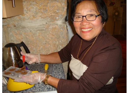
A WAGEC client cooking up a storm

Thank you Street Smart Australia for supporting the Homeless Community at WAGEC.